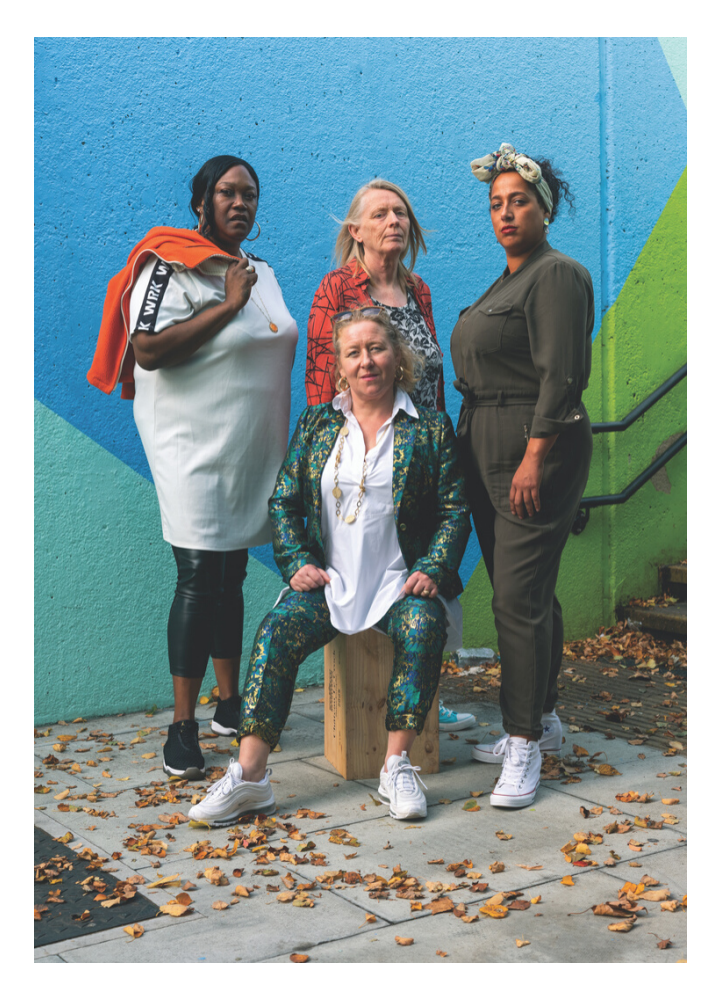
"This phenomenal company's activity: it is vital, humane work with real theatrical heft."